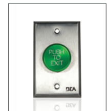
10ACPBDA12 1 5/8" SINGLE, TEXT ONLY