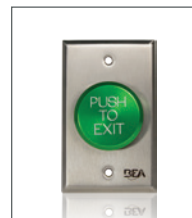
10ACPBDA10 2" SINGLE, TEXT ONLY