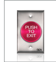
10ACPBDA2 2" SINGLE, TEXT ONLY