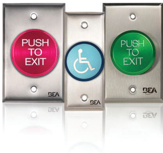
SHOWN ABOVE: SINGLE STYLE WITH RED AND GREEN 2" BUTTON JAMB STYLE WITH BLUE 1 5/8" BUTTON