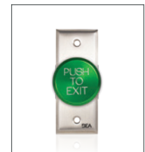
10ACPBDA9 2" JAMB, TEXT ONLY