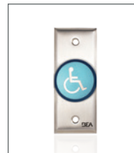
10ACPBDA7 1 5/8" JAMB, LOGO ONLY