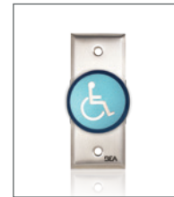
10ACPBDA5 2" JAMB, LOGO ONLY