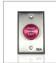
10ACPBDA4 1 5/8" SINGLE, TEXT ONLY