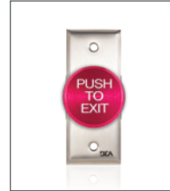
10ACPBDA1 2" JAMB, TEXT ONLY