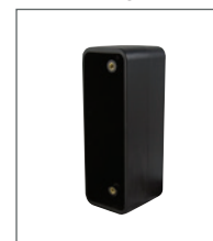
10BOXJAMBST JAMB SURFACE MOUNT