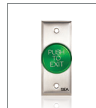
10ACPBDA11 1 5/8" JAMB, TEXT ONLY