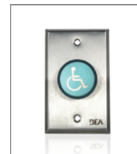
10ACPBDA8 1 5/8" SINGLE, LOGO ONLY