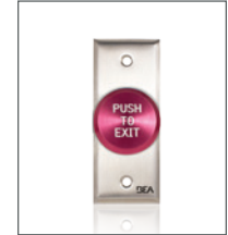
10ACPBDA3 1 5/8" JAMB, TEXT ONLY