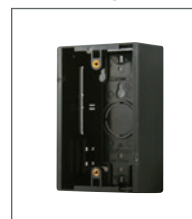
10BOX24SGSM STANDARD SURFACE MOUNT