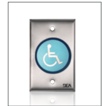
10ACPBDA6 2" SINGLE, LOGO ONLY